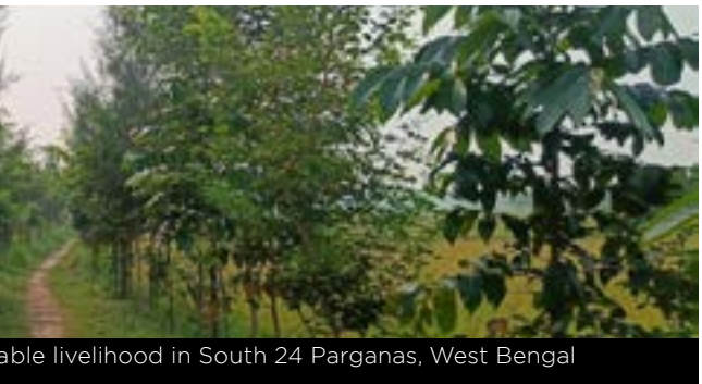
sustainable livelihood in South 24 Parganas, West Bengal