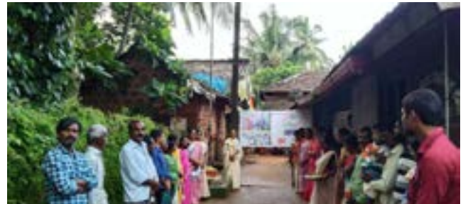
Har Ghar Tiranga Campaign, Uttara Kannada, Karnataka