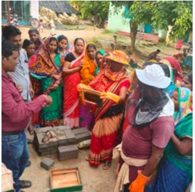
Beekeeping training programme for women Self Help Group for sustainable livelihood, Cuttack, Odisha