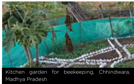
Kitchen garden for beekeeping, Chhindwara, Madhya Pradesh