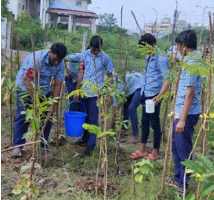
School students participating in tree plantation and maintenance of Miyawaki urban forest, Chennai, Tamil Nadu