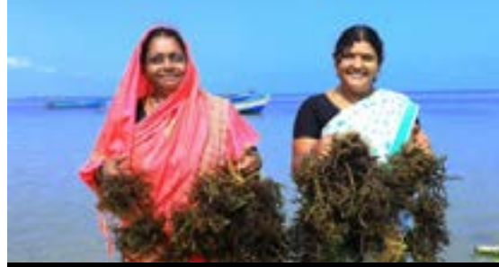
Mangrove tree plantation and seaweed farming for coastal communities, Viluppuram & Ramanathapuram, Tamil Nadu