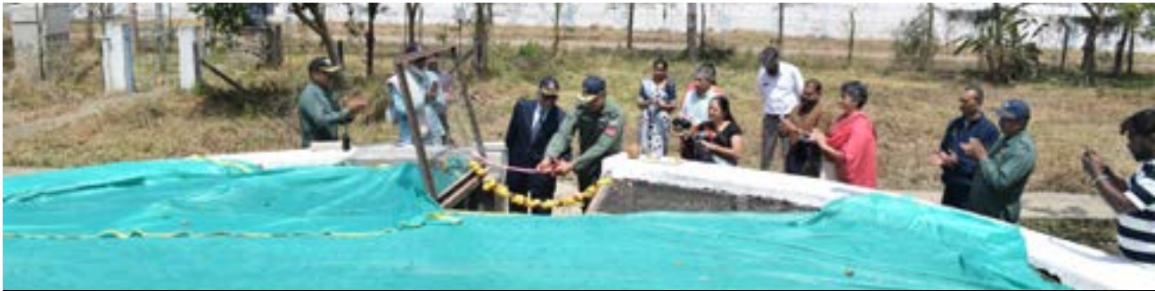
Water conservation for sustainable future, revival of traditional open well, Bengaluru, Karnataka