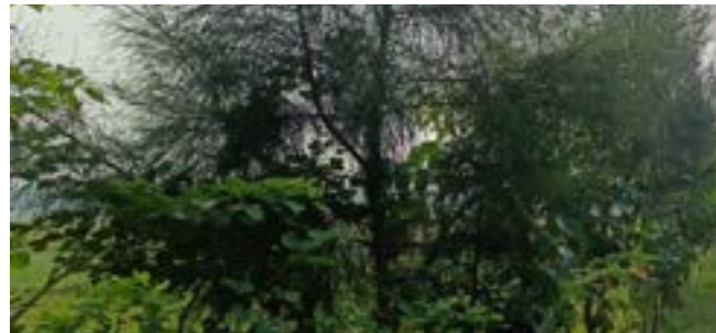
Ecosystem restoration through tree plantation for sustain