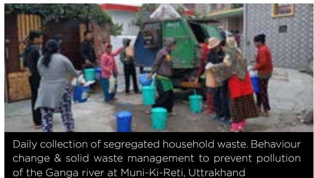
Daily collection of segregated household waste. Behaviour change & solid waste management to prevent pollution of the Ganga river at Muni-Ki-Reti, Uttarakhand