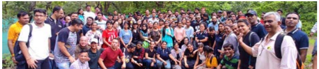
Habitat restoration, nature trail development for forest landscape through Assisted Natural Regeneration, Sanjay Gandhi National Park, Mumbai, Maharashtra