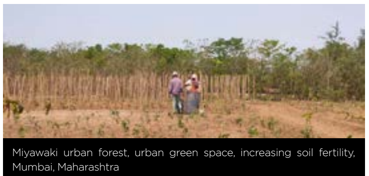
Miyawaki urban forest, urban green space, increasing soil fertility, Mumbai, Maharashtra