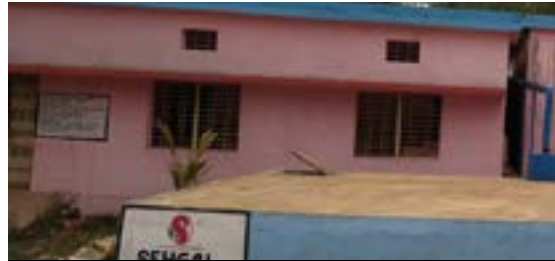
Rain water harvesting to supply potable water for school going tribal girl's government hostel, Panna, Madhya Pradesh