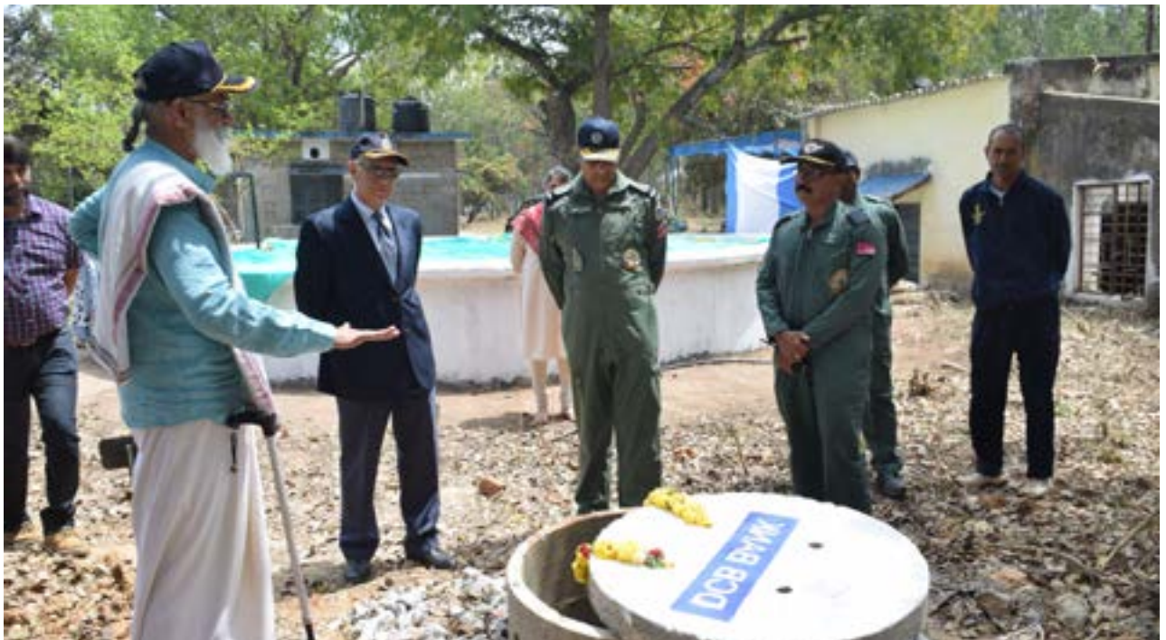
Water harvesting through Rainwater Recharge Wells, Bengaluru, Karnataka