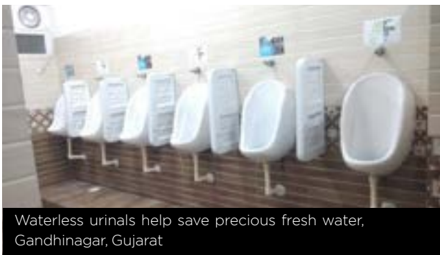
Waterless urinals help save precious fresh water, Gandhinagar, Gujarat