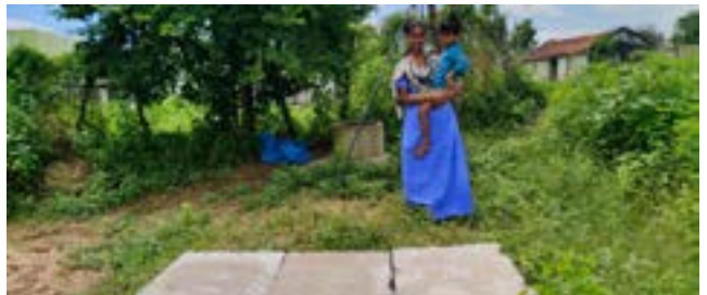
Waste management through bio-digester, using the cattle waste to provide biogas to rural homes. Reducing smoke pollution, reduction of methane and dependency on firewood, Adilabad, Telangana