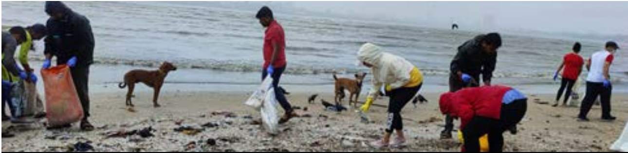
Beach cleanup, Mumbai, Maharashtra