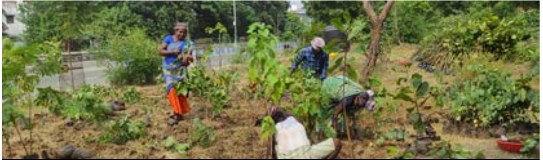
Tree plantation for greening urban space, Chennai, Tamil Nadu