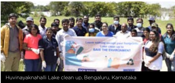
Huvinayaknahalli Lake clean up, Bengaluru, Karnataka