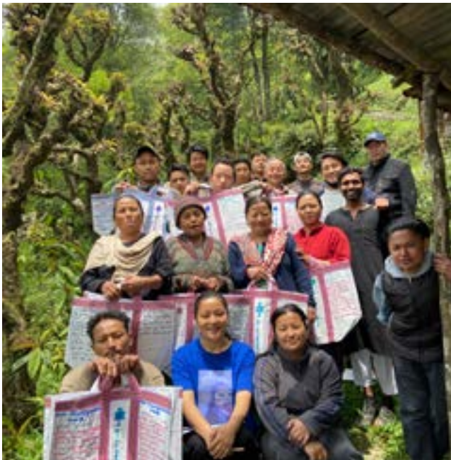
Community awareness programme for the management of the village waste, Sonada, West Bengal