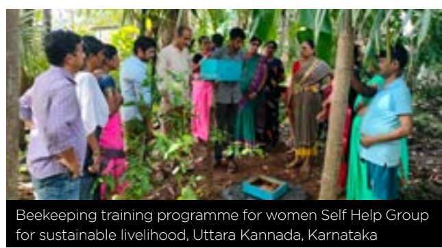
Beekeeping training programme for women Self Help Group for sustainable livelihood, Uttara Kannada, Karnataka